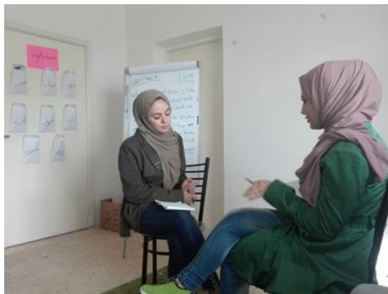
GRU training in Madaba

The girls developed a research plan to answer their research questions in the coming few months. Each GRU came up with its own plan, in which each girl researcher in the GRU will take the lead on four interviews, and attend four interviews with her peer researcher as a note taker. The girls will conduct their interviews in pairs and will be accompanied by their research mentors. Their plans included their research question, where they will conduct their research, and when they will conduct their interviews. They also planned their target group, including the age, gender, and nationalities of the interviewees. The girls are still in the process of developing the detailed research questions, which they will finalize in upcoming meetings with their research mentors. (Appendix B has the detailed plans.)