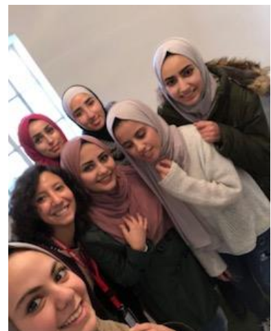
GRU training in Madaba

18 girls were recruited from the three areas, 6 from each, through community based organizations along with Mercy Corps and Action Aid. We ensured the most diverse group of girls possible. The girls are between the ages of 16 and 19 years old; there are school and university students and out-of-school girls in the three girl research units. Moreover, the research units include Jordanian, Palestinian, Iraqi and Egyptian girls. It was challenging to recruit Syrian adolescents as researchers; however, one of the mentors is Syrian. To further ensure the inclusion of Syrian girls, the girl researchers made