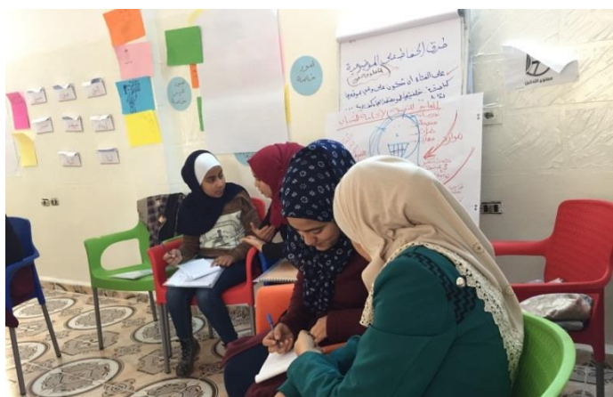
GRU training in Al Balqa

Development that are also necessary for research, such as goal setting and