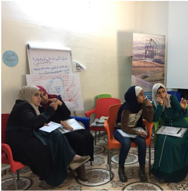
GRU training in Al Balqa

The girls in the three areas are looking forward to being in the field and to get these interviews rolling. After the training was completed, one of the girl researchers in Balqa mentioned that she had a dream of herself conducting an interview for the research. Now she and her peers in the GRU will make this happen!