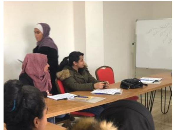
GRU training in Amman

The general rating of their characteristics as researchers improved; there was also an increase in what they know about research, and a clearer understanding of objectivity in research and in the way questions should be objective. The girls also were able to define what research is, and point to previous research experiences that they could not name as research before the training.