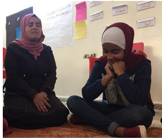
GRU training in Al Balqa

The girls used drawing to develop their research question: the research mentors asked them to dream of what makes a safe city for them, and then to draw it. Each GRU came up with criteria for a safe city as well as challenges to creating and keeping cities safe, which was reflected in the girls' research questions.