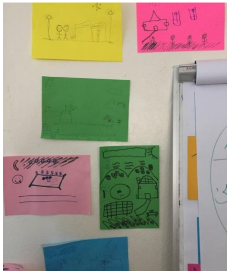
Girls' drawings, GRU training in Al Balqa

In Amman, the girls were interested in exploring what would girls their age need to feel safe while on the street.