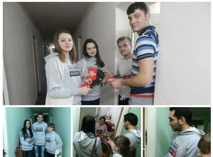
Challenger participants canvass and get out the vote for parliamentary elections

Despite successive pro-European governments making progress toward Moldova’s European future with the signing of an Association Agreement, Moldova’s democratic transition has stalled, while Moldovan government agencies and political parties often lack the policy capacity to develop appropriate solutions to the country’s pressing issues. This deficiency is rooted in the education system’s decades-long emphasis on rote learning and memorization to the detriment of critical thinking, discussion, and research skills. Therefore, much of the current and next generation of politicians and civil servants are not well-equipped to develop policy. In addition to limiting effective policy development, the dearth of adequately qualified applicants opens the door for nepotism and corruption in the government hiring process.