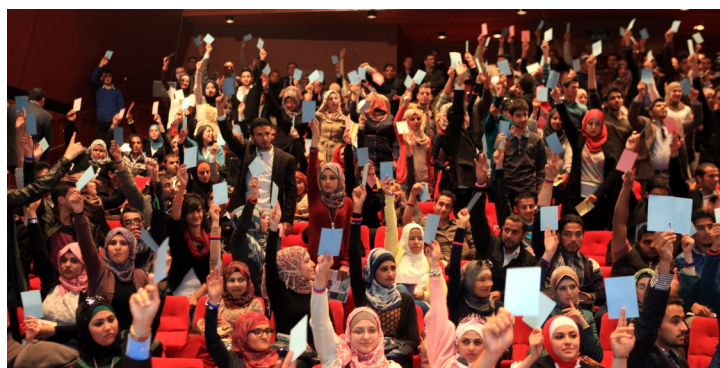
Ana Usharek participants vote in a debate competition

The relationship between “soft skills” and political engagement may be different for men and women. For example, NDI discussions with young women activists suggests that building these abilities is particularly important for them, as they may be at more of a deficit in certain areas due to unequal educational and other opportuni-