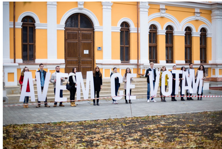
Challenger participants in Moldova conduct get out the vote efforts

The Organization for Economic Co-operation Development (OECD) uses the term "social and emotional skills," which it defines as the skills involved in "achieving goals, working with others and managing emotions." 2 Other terms that have been used to describe them include "life" skills and "human and conceptual" skills.